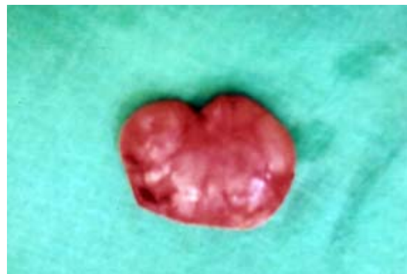
Fig. 2: Swelling in the floor of mouth after excision.