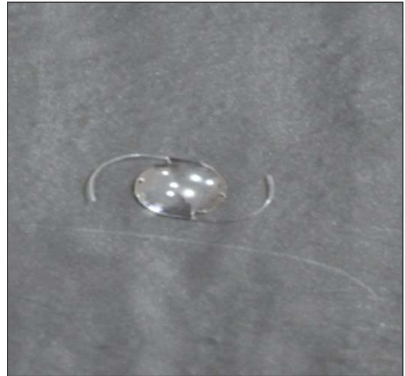
Fig. 2: Recovered intra ocular lens after washing.